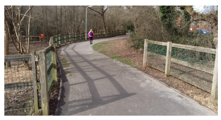
Following removal of the 4 Plane trees from the Old School House, 5 new trees have been planted at St. Johns Recreation Ground.