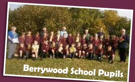
Berrywood School Pupils

Seeing the happy, healthy and excited pupils at Hedge End’s Berrywood School planting purple crocuses in their beautiful school grounds in October, it is a reminder that, not so many years ago some children in Britain were suffering the life changing effects of the terrible disease of polio.