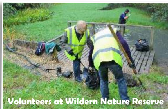
Volunteers at Wildern Nature Reserve

If you would like to become a Conservation Volunteer and could spare a couple of hours a month, please call: 01489 780440 or email: reception@hedgeend-tc.gov.uk