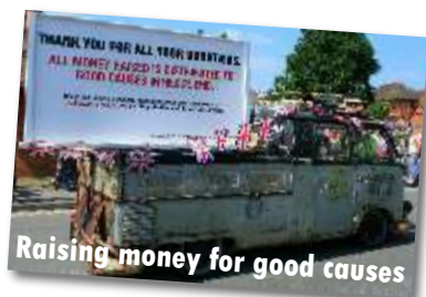
Raising money for good causes

your door inside the June edition of the HEDGE END & BOTLEY COURIER . More information is on the carnival website, for the most up to date news visit our Facebook page. See you there!