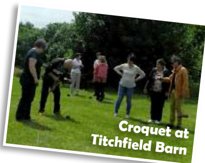
Croquet at Titchfield Barn

A Barbecue at the historic Titchfield Barn was our Sunday event. We learned that the barn was built to store the supplies in readiness for the battle of Agincourt, so we didn't emphasise that aspect too much.