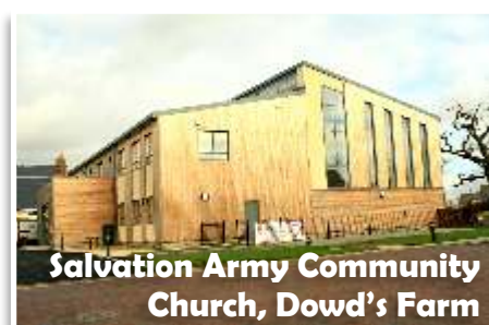
Salvation Army Community Church, Dowd's Farm