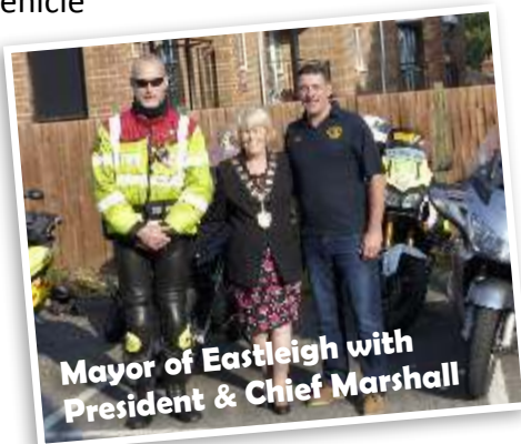
Mayor of Eastleigh with President & Chief Marshall

The Hampshire Fire and Rescue Service Community Contact Point vehicle was in attendance with plenty of information and also the opportunity to try a "ride simulator".