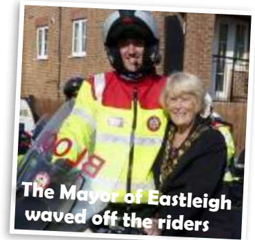
The Mayor of Eastleigh waved off the riders

Everyone seemed to agree that the ride had been very enjoyable and well marshalled and the Rotary club were very grateful to Budgens, Popham Airfield, Hampshire Fire Service, SERV-Wessex and of course everyone who took part, for their help and support.