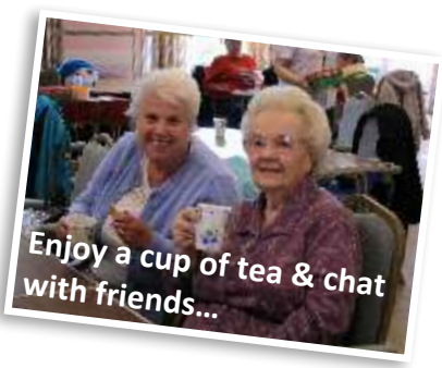
Enjoy a cup of tea & chat with friends...

The Over Sixties Club meet weekly between 1pm and 3.30pm at the 2000 Centre, St Johns Rd, Hedge End. We are currently looking for new members to join - you will be made to feel most welcome!