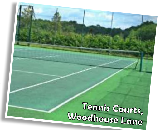
Tennis Courts, Woodhouse Lane

Work is also underway to improve the facilities at the tennis courts at Woodhouse Lane, but more on that later. Suffice to say, we hope this will lead to a renewed enthusiasm for this enjoyable game.