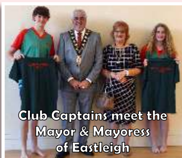
Club Captains meet the Mayor & Mayoress of Eastleigh