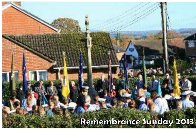
Remembrance Sunday 2013

We held our annual commemoration on Remembrance Sunday when the various uniformed organisations, along with many other groups, walked up St John's Road to the small War Memorial garden by St John's Church. A moving service was held and this, of course, had an added poignancy