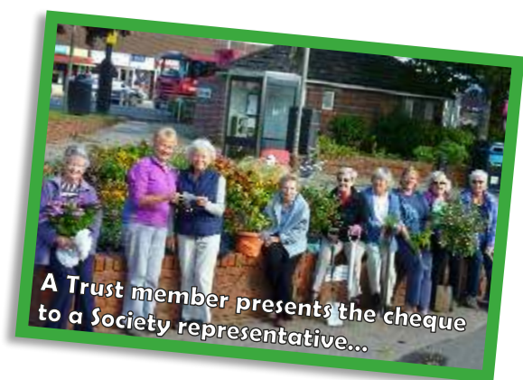
A Trust member presents the cheque to a Society representative...

The Hampshire Gardens Trust has contributed £200 to Hedge End Horticultural Society to provide shrubs for the Hedge End Town Green. Since last year the Society has ably taken over the care and maintenance of the Green from the Town Council.