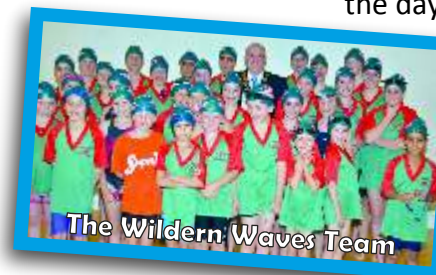
The Wildern Waves Team

Championships, opened by the Mayor of Eastleigh. Lots of competitive swimming was seen throughout the day and fun was had