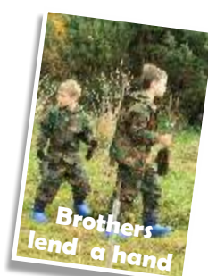
Brothers lend a hand

SAPLING (a seed taken from one of the Royal Household Estates).