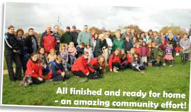
All finished and ready for home - an amazing community effort!

Thank you to all those who took part in our tree planting event on Saturday 17 November 2012. Our volunteers successfully planted 420 native trees to celebrate the Queen's Diamond Jubilee in just over an hour!