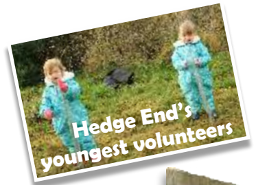
Hedge End's youngest volunteers

Native woods are a haven for wildlife and beneficial for our health and well-being. They can also provide excellent game cover, produce timber and wood fuel, help with pollution control, reduce soil erosion and can make an important contribution to addressing the challenges of climate change. In this instance, the Town Council hopes that the trees will thrive and be appreciated by the community of Hedge End long into the future.