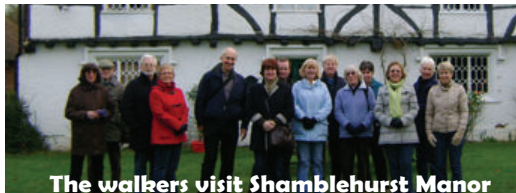
The walkers visit Shamblehurst Manor

Download this walk from the council website: www.hedgeend-tc.gov.uk/local-services/parks-and-childrens-play/ . Hedge End pocket maps can also be collected from the Town Council offices.