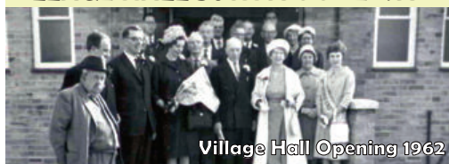
Village Hall Opening 1962

2012 marks a significant anniversary for the Village Hall as it was on the 28th April 1962 that after many years of planning and fund raising that the building was declared open. The wording on the plaque was chosen very carefully "This plaque commemorates the work of many villagers who having given much time and thought to the project, opened this hall for the use of the community on April 28th 1962".