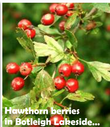
Hawthorn berries in Botleigh Lakeside...

Back home I saw some people gathering blackberries and plums. In and around Hedge End, it is evident that it has been a good year for some fruits as the ones alongside the roads and pavements show only too well. It has also been a very good year for both roses and hydrangeas, as well as a lot of other flowers seen in our gardens over the summer.