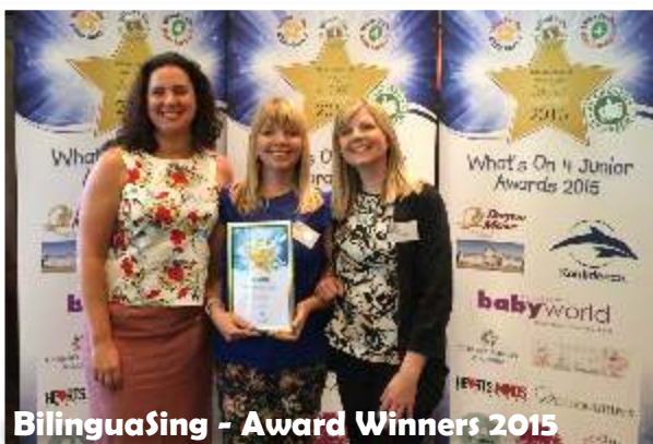
BilinguaSing - Award Winners 2015

For more information contact Lourdes on 07736 253375 or lourdes@bilinguasing.com