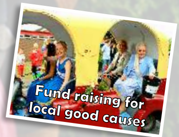
Fund raising for local good causes

None of these tasks are arduous, they can be enjoyable and only take a couple of hours and you can take pride in keeping the carnival alive. Hedge End Carnival is a real community event, so it is over to you to see what you can do as we really want another 20 people who can find a few hours to support their community on carnival day.