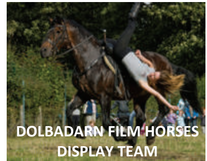
DOLBADARN FILM HORSES DISPLAY TEAM

There are children's competitions in painting, cupcakes and of course the LEGO MODEL COMPETITION where the FIRST PRIZE IS A FAMILY DAY OUT AT LEGOLAND!!