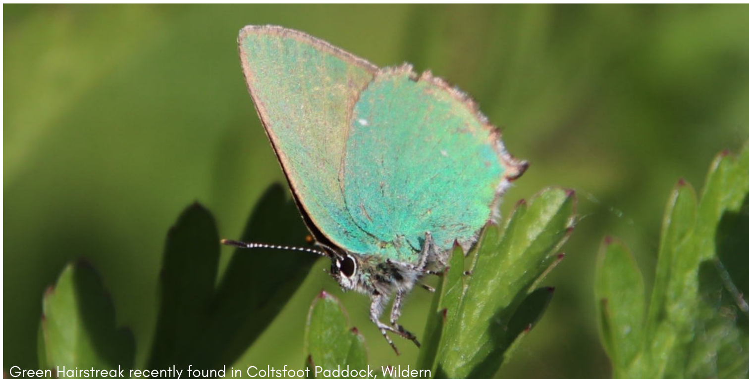
Green Hairstreak recently found in Coltsfoot Paddock, Wildern