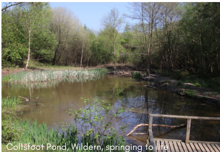
Coltsfoot Pond, Wildern, springing to life

and drink containers, etc, rather than place into bins provided. Volunteers working in an area will include litter removal among their tasks.