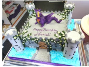
▲ A cake by one of the shop's expert decorators.

We pride ourselves on offering a service that online businesses don't, which is advice and personal reviews and recommendations. We find out individual needs and always know what to recommend someone".